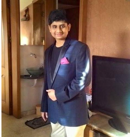
PARAM BATAVIA SY IT