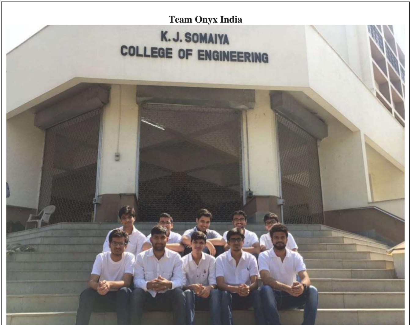
Photo of members/committee – 2016-2017