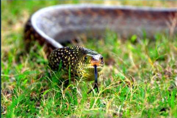
VAIBHAV KOYANDE, FYBMM, 2016