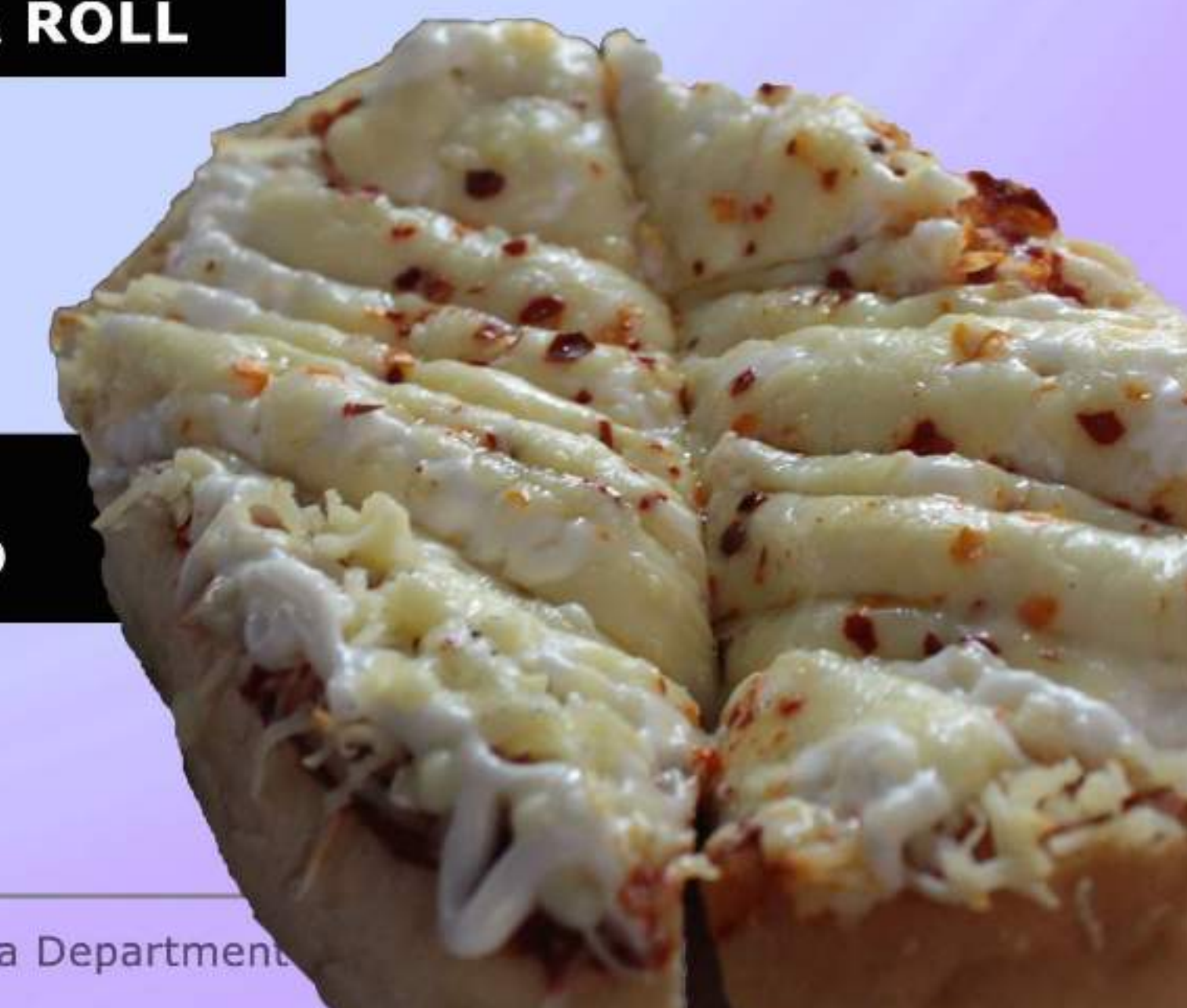
CHEESE MAYO GARLIC BREAD