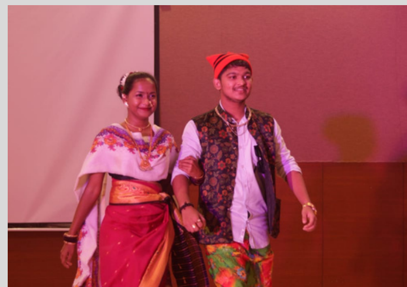
The college organizes various technical, literary, performing and fine arts competition at its inter collegiate fest Utkarsh, which allow the students to discover new facets of their personalities.

The Cultural Forum organises annually various cultural activities which is aimed at the overall development of the student as well as providing the man opportunity to inculcate a sense of healthy competition. It has emerged as a popular event amongst the student community in the Mumbai University region and has been attracting a large number of students from several colleges of Mumbai.